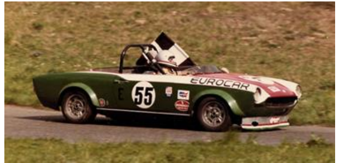
Great Racing Fiat winning at Seattle International Raceway

Related to PM Time, planning the project with an intact team improves communication, and increases team member acceptance and effectiveness in managing their own part of the project. This is in contrast to those Project Managers who fail to optimize teamwork, and instead apply inept delegation, imposed deadlines, and inaction in response to raised issues. We’ve seen the successes generated by stellar teamwork, both in racing and in projects, and would not have it any other way.