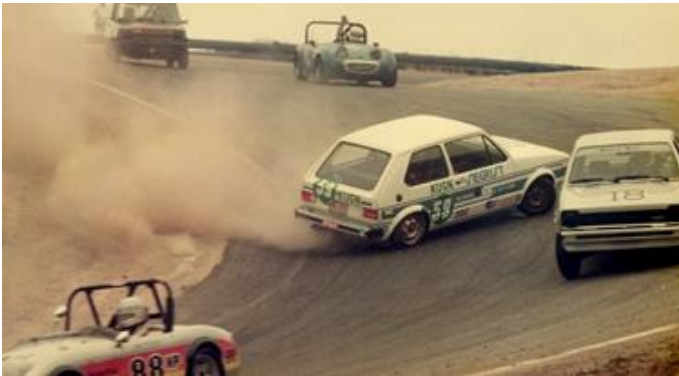
Great Racing Rabbit on the Corkscrew at Laguna Seca

You review your funding, projecting how to make limited funds stretch through the end of the season. Truly learning how to do more with less, you might do things you would prefer to contract out to get a better job done, faster. All while tenderly treating, wiping down, waxing and grooming your car you will mercilessly throw through the nastiest curves in the West at Laguna Seca next weekend.