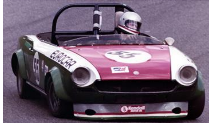
Great Racing Fiat at Sears Point, California

Preparation was 90% of winning, but in a sport where success can be measured in tenths of seconds, that last 10% is a killer. In racing, you operate at 100% peak performance and acuity for an hour or more. At times in the last half of a race, those who could not sustain that level of intensity get brain-fade and do something stupid, like drive off the track at the end of a straight. This resulted from a tenth-second distraction. We've seen few activities as attention-sensitive—aside from most projects.